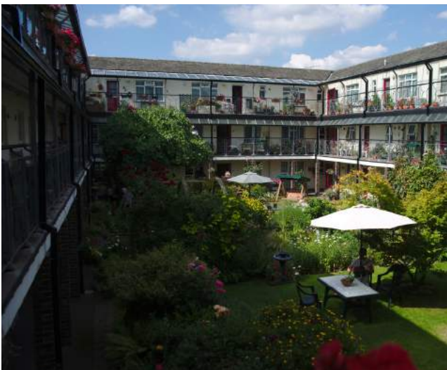
John Betts House

There are 40 flats at John Betts House some of which are suitable for couples. All upstairs flats are reached by a lift.